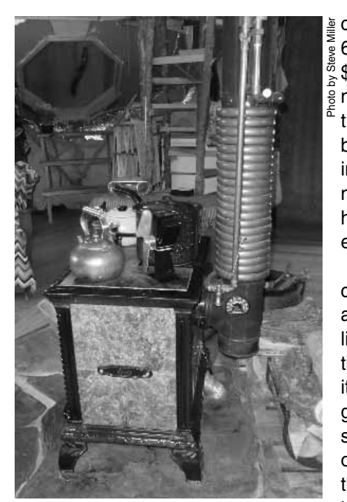
Author Steve Miller's Hearthstone wood stove, with a heat exchanger coiled around the vertical stove pipe.

coil is expensive; 60 feet cost me $340. I held off making the coil for two weeks, just to be sure I would be in the right state of mind to bend this heavy coil into an even spiral.