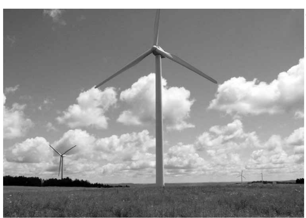
Wind farms and methane power plants are cropping up around New York State as electric co-ops and other utilities combat rising power costs with local, renewable energy. Pictured above is the Fenner Wind Farm in Morrisville; unfortunately, the local co-op can't tap into its power, but at least the wind farm is greening up the New York grid.

To protect its water source the city has purchased vast amounts of