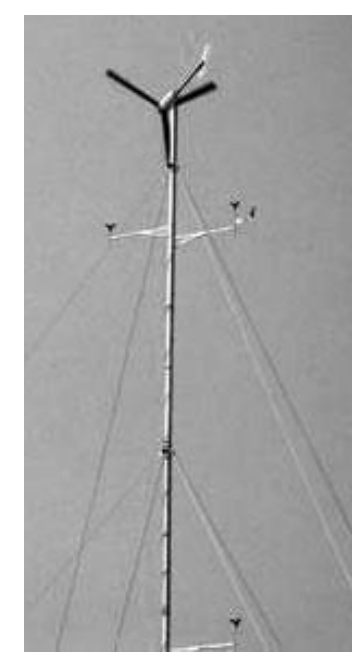
A temporary tower, equipped with windmeasurement technology, takes readings at a potential wind-turbine site.

The first step for developing small-scale wind electric projects is to determine the generating potential of a prospective site. The Vermont Anemometer Loan Program (VTALP) provides the instrumentation and technology for that purpose.